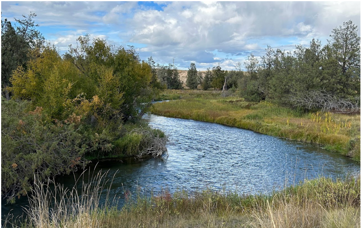
Bison Range on the Flathead Reservation, Western Montana.